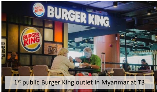
1 st public Burger King outlet in Myanmar at T3

T3 offers a brand new shopping and dining experience for the domestic traveller to indulge the senses.